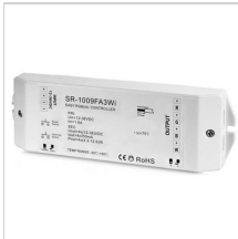
3104163 RGBW WIFI controller 4 channel (0.35A each CH)