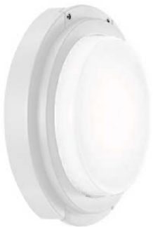
Flat Polycarb Lens

Performance in Lighting reserves the right to make all necessary changes without prior notice.