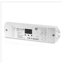
178973 RGBW DMX enabler/decoder 4 channel (0.35A each CH)