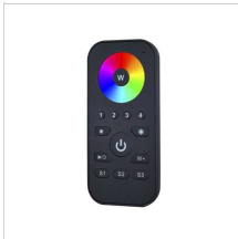
310429 RGBW hand held remote