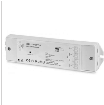
3104173 RGBW RF controller 4 channel (0.35A each CH)