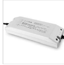
17096 Kit driver 48V WP